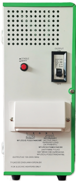
GREEN BOOST MPPT 3000T