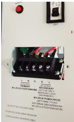
GREEN BOOST MPPT 3000T