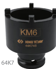
44K7 & 64K7