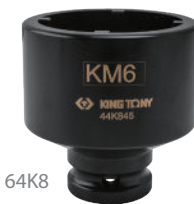
44K8 & 64K8